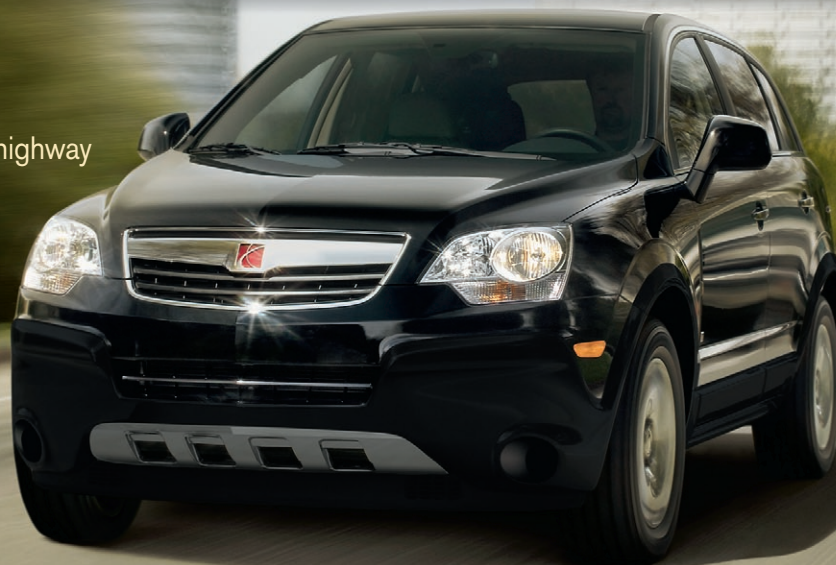
Saturn VUE XE FWD shown in Black Onyx with available features.