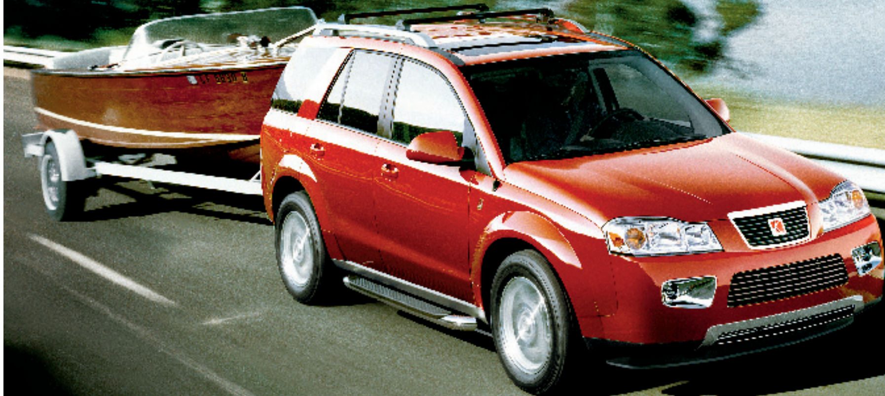
2007 Saturn VUE shown in Chili Pepper Red with available features.

*One-year Safe & Sound Service Plan is standard. Call 1-888-4ONSTAR (1-888-466-7827) or visit onstar.com for system limitations and details. †Five-star rating is for the driver and passenger in the frontal crash test and for the front and rear occupants in the side-impact crash test. Government star ratings are part of the National Highway Traffic Safety Administration's (NHTSA's) New Car Assessment Program ( safercar.gov ).