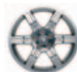
17" Standard Forged Alloy