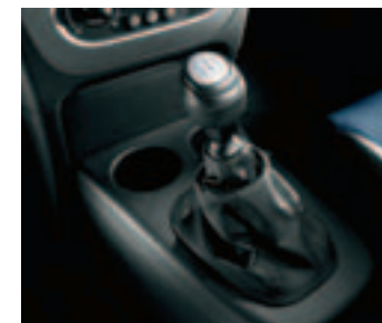
Heavy-duty five-speed manual transmission with close-ratio gearing and short-throw shifter