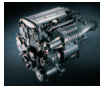
205-hp 2.0-liter, supercharged engine