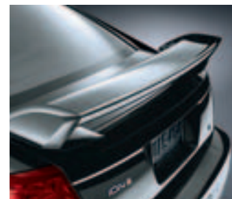
Available aero-wing spoiler